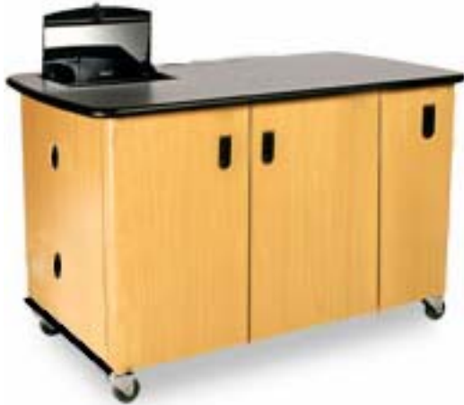
(Standard unit shown above)